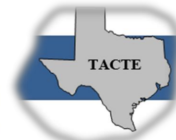
(Texas Association of Colleges for Teacher Education)